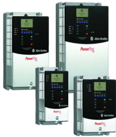
ABB AC Tech Aero-Tech Allen Bradley AMTECH Baldor Bardac Beel Benshaw Bodine Boston Gear Bridgeport Browning Carotron